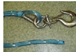
Swivel Eye Hook and Bow Shackle