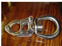
Trigger Release Shackle

B2. Eye Splices are hand sewn, whipped, and made-to-order