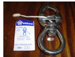
Quick Release Snap Shackle