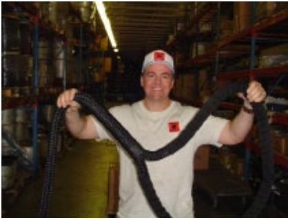
36" Covered Eye Splice