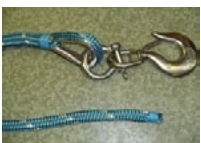
Swivel Eye Hook and Bow Shackle