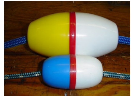
Optional Lock-On Rope Floats