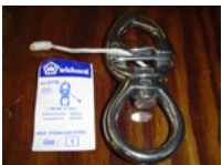
Quick Release Snap Shackle