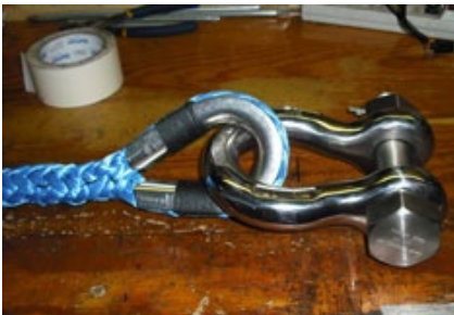
Tow Leg with a Safety Bolted Shackle