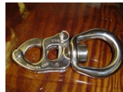
Trigger Release Shackle

We will assist the customer in selecting the hardware that matches the W.L. of the line.