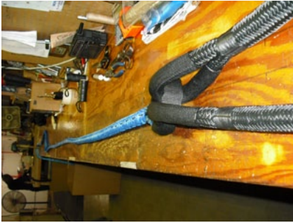
Y-Point with stern legs to the right and tow leg the left