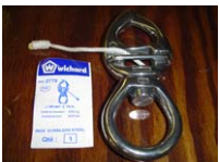
Quick Release Snap Shackle