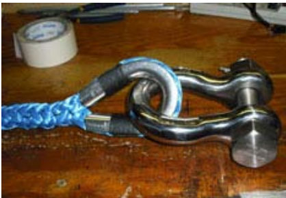
Tow Leg with a Safety Bolted