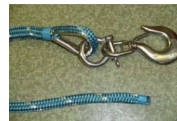
Swivel Eye Hook and Bow Shackle