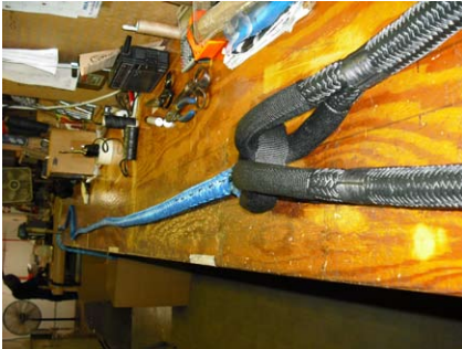
Y-Point with stern legs to the right and tow leg the left