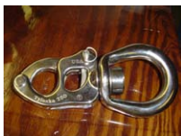
Trigger Release Shackle

B2. Eye Splices are hand sewn & whipped, and made-to-order