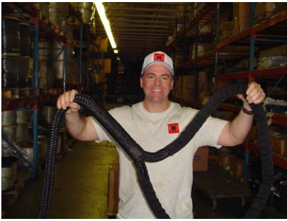
36" Covered Eye Splice