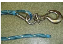
Swivel Eye Hook and Bow Shackle