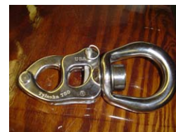
Trigger Release Shackle

We will assist the customer in selecting the hardware that matches the W.L. of the line.