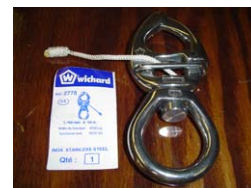
Quick Release Snap Shackle